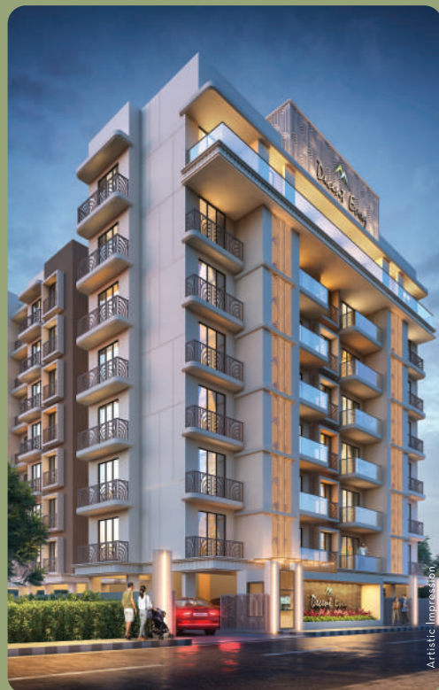
DECENT EVOQ Palghar [West]