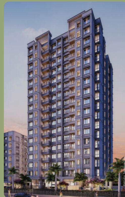
DECENT SKYRISE Palghar [East]