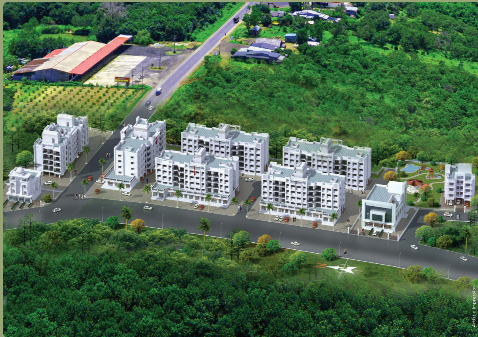
CELLO DECENT HOMES Palghar [East]