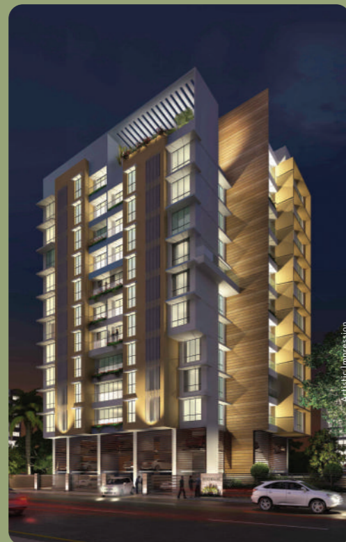
DECENT SEYCHELLES Santacruz [East]